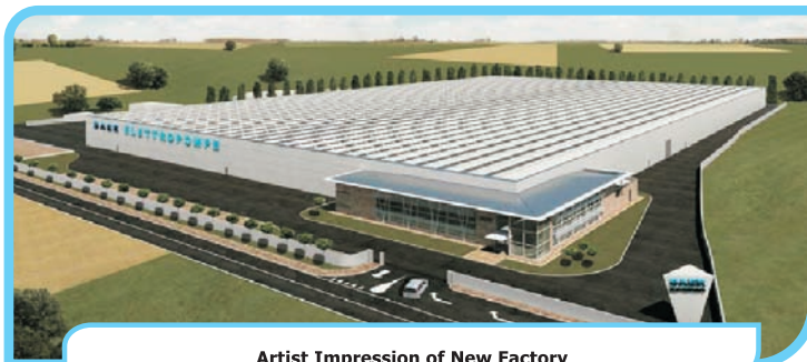
Artist Impression of New Factory